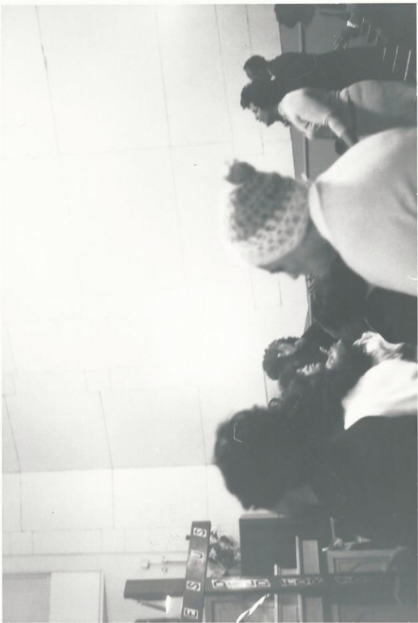
• APR • 72