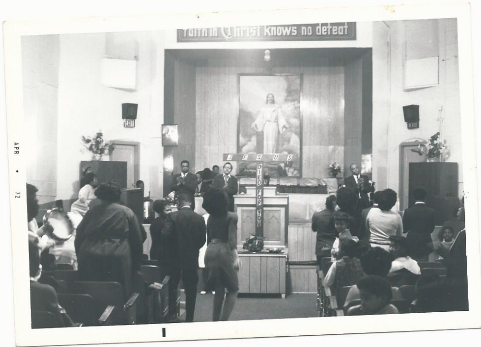
APR • 72